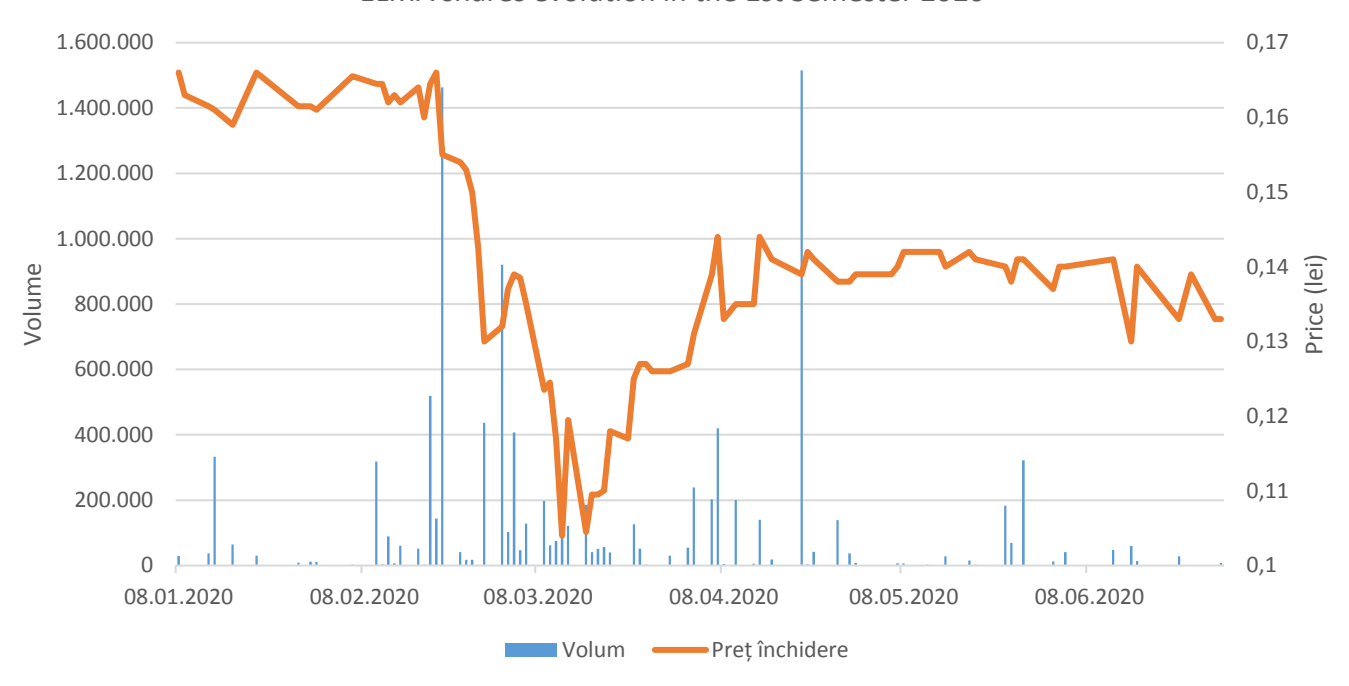
ELMA shares evolution in the 1st Semester 2020

In S1 2020 there were traded shares representing 1.527~% of the total number of shares, adding up to 2.16~% of the Company share capital, for an average price of 0.1414 lei/share. The reference price varied between minimum 0.1040 lei/share and maximum 0.1660/share. The closing price at the end of S1 was 0.133 lei/share corresponding to a market capitalisation of 89,913,147.632 million lei.